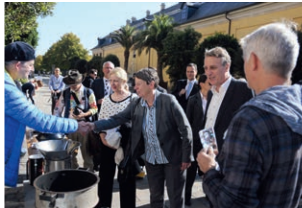
Initiatives and projects used the outdoor areas to present their ideas.