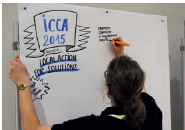
Potentials and conditions of local initiatives were a focus of the high-level panel.

I shared how the Transition community energy projects in “21 Stories” have, between them, raised over £13 million in investment, mostly from local people, and saved over 9,000 metric tons of CO 2 through the electricity they have generated. But in such projects, what are they really generating? I talked about a food growing project in the centre of Brussels, where the community took over the street after local officials blocked it to try to prevent kerb crawlers, and built a food garden in which 13 families now grow food, in the middle of the street. As one of the group told me: “It changed the street enormously because before it was never a street that you would walk by or stop in, and now I get to stop here and spend several hours a week taking care of my little plot of land. And even for the people who are not part of the group, it changed the perception of what a neighbourhood is. We see a lot more people smiling and stopping by to chat and spend some time here.”