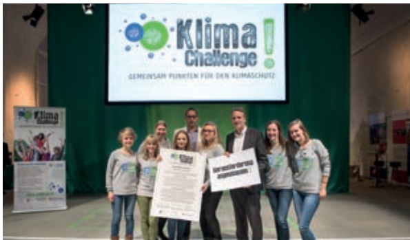
Environment Minister Stefan Wenzel (third from right) takes on the Climate Challenge.

The Youth State Theatre of Braunschweig invited the audience to participate in their play “The Climate Conference”. The play focused on the role of the individual consumer and personal political involvement, which were also key themes of the Forum on Food and Culture (see page 21 for more details).