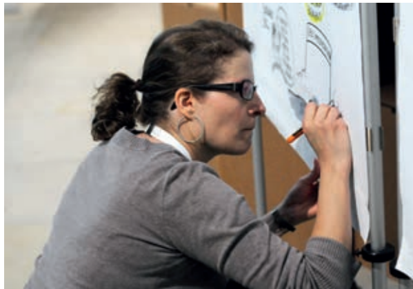
The participatory process in the Climate Neighbourhoods was also included in the Hanover Declaration.