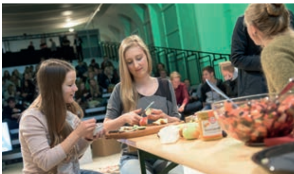
Climate-friendly food was the focus of the forum on food and culture.