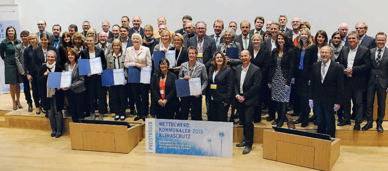
The prize winners and awards presenters after the ceremony.

The German government has declared its goal to reduce its greenhouse gas emissions by 40 per cent by 2020 compared to 1990.