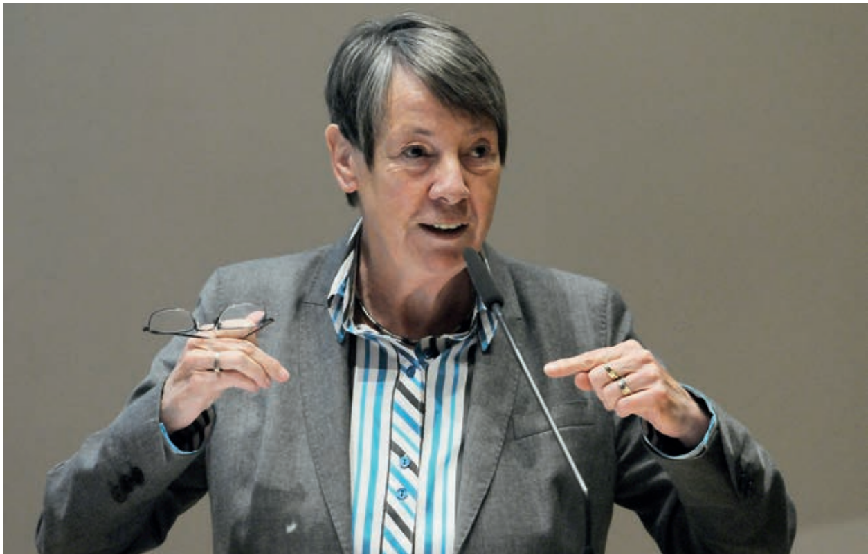
Federal Environment Minister Dr Barbara Hendricks emphasised the important role of municipal involvement in climate action.