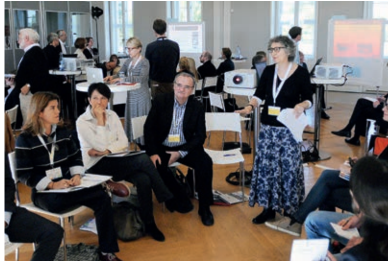
Dialogue and discussion about matters of strategy took center stage at the ICCA2015.