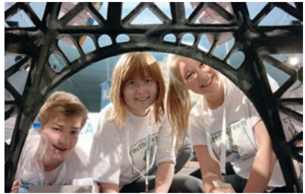
Members of youththinkgreen – jugend denkt um.welt collecting messages from the model of the Eiffel Tower.