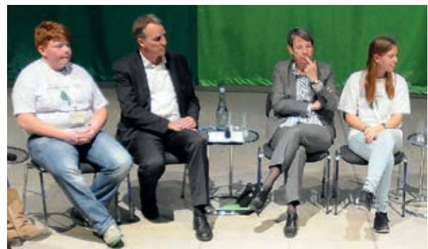
During a fishbowl discussion pupils met with representatives from politics and civil society.