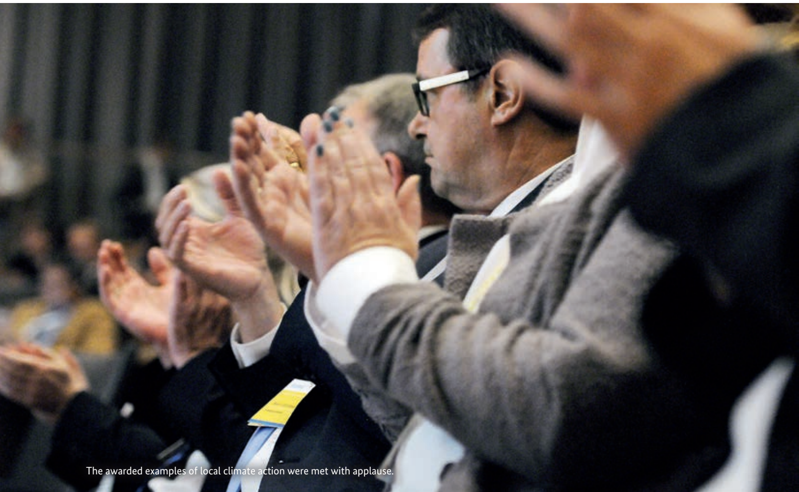
The awarded examples of local climate action were met with applause.