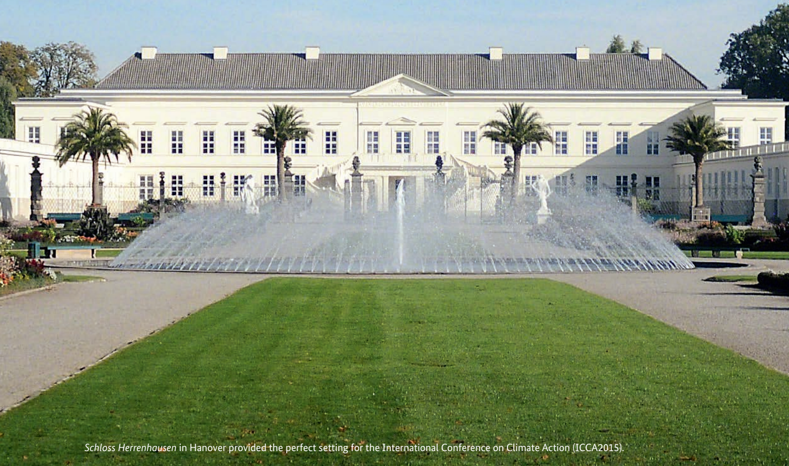
Schloss Herrenhausen in Hanover provided the perfect setting for the International Conference on Climate Action (ICCA2015).