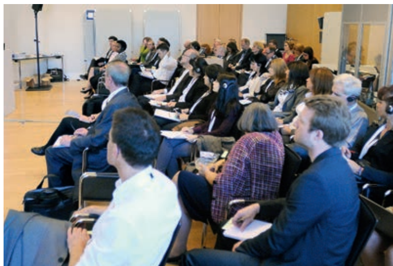
Participants at the workshop “Adapting to Climate Change.”