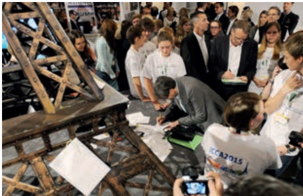
Federal Minister Dr Barbara Hendricks also delivered a message during her visit to the Climate Neighbourhoods.