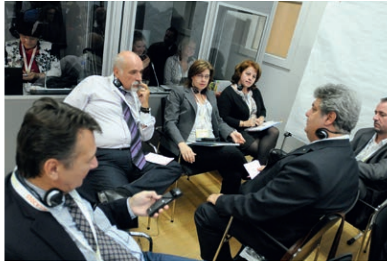
To ensure the inclusion of participants, the workshop was interpreted simultaneously into as many as six languages.