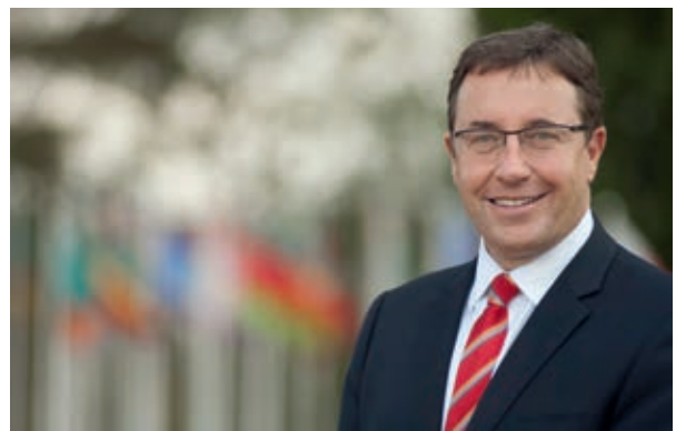
In his video message, Achim Steiner (UNEP Executive Director and Under-Secretary-General of the United Nations) addressed the importance of local governments and actors for the implementation of the SDGs as well as climate action and adaptation measures.