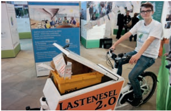
The collected messages were transported to the conference centre with a cargobike.