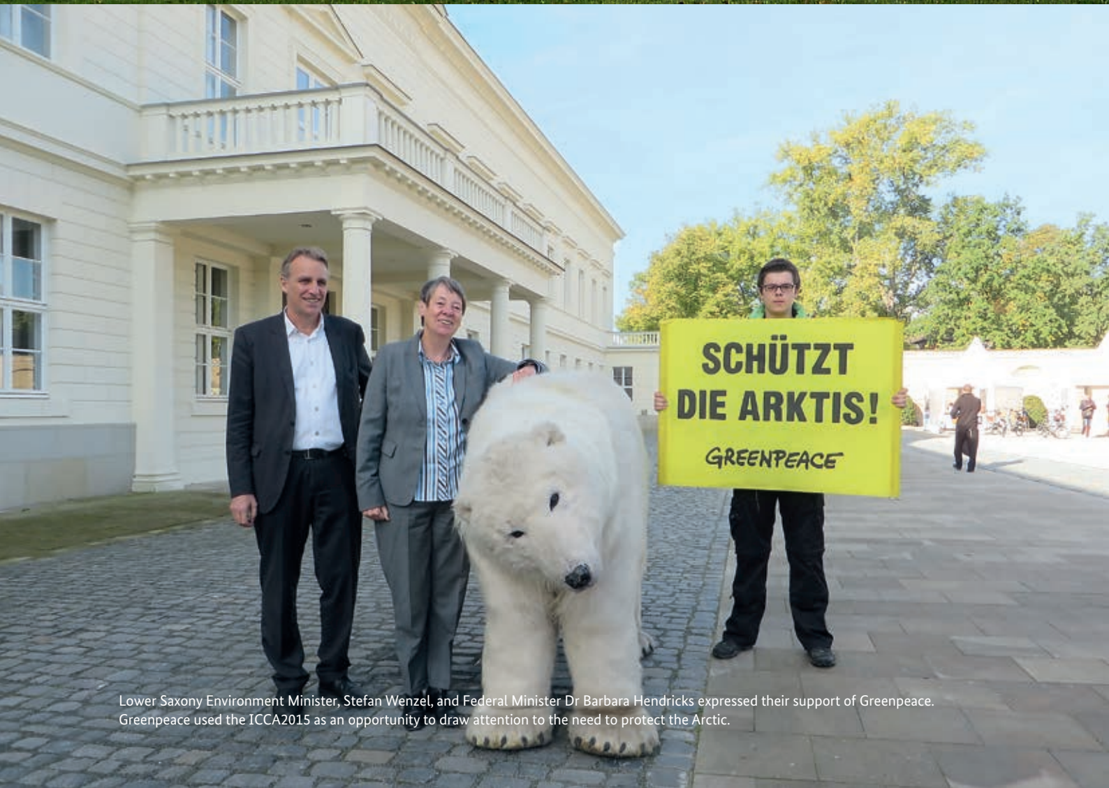
Lower Saxony Environment Minister, Stefan Wenzel, and Federal Minister Dr Barbara Hendricks expressed their support of Greenpeace. Greenpeace used the ICCA2015 as an opportunity to draw attention to the need to protect the Arctic.