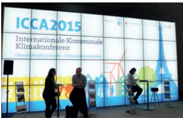
The Climate Neighbourhoods event was both informative and interactive.