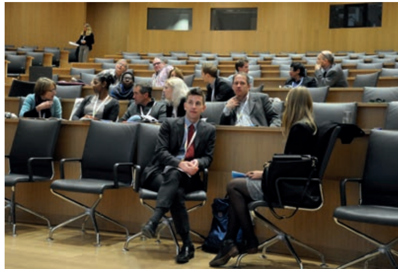
Discussing benefits and best-practices of multinational cooperation.