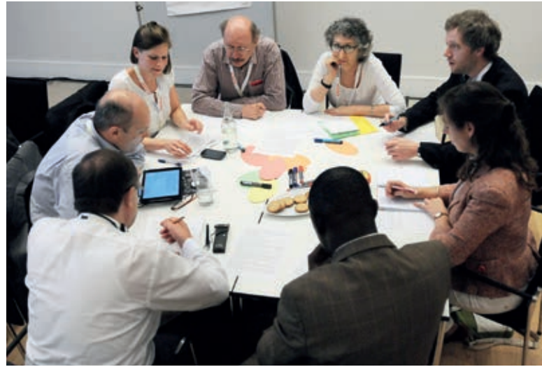
The goal of all workshops was an interactive exchange.