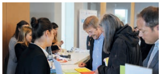
Participants could choose from eighteen Workshops in six thematic clusters and three forums on climate culture.

The essence of each of ICCAs’ elements was incorporated in the conference conclusions. Throughout the entire conference, Cluster Leads and rapporteurs for each topic worked on the final document and ensured, that the diversity of topics and perspectives was reflected. In doing so, the Hanover Declaration confirms the key role played by municipalities in this transformation process. This process requires continuous learning and a long-term change in our behaviour, our way of thinking and the underlying structures to successfully tackle climate change.