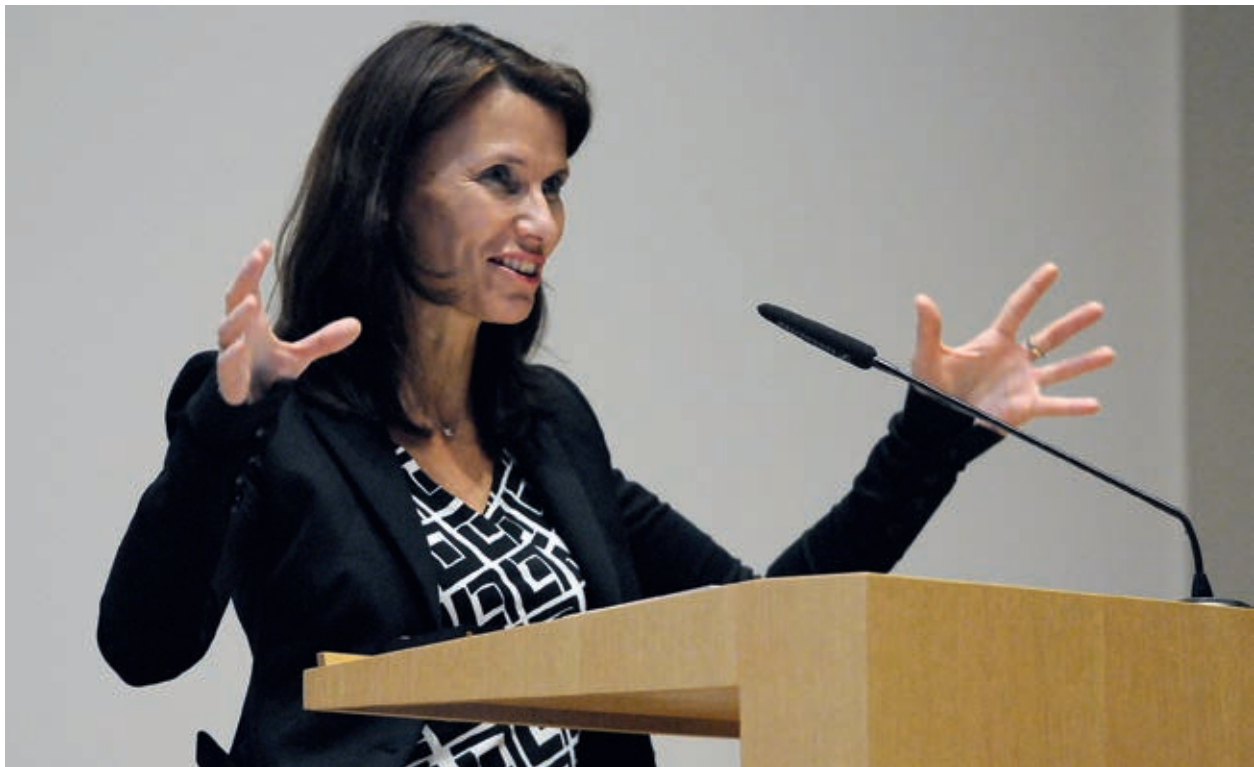
The Parliamentary State Secretary during her welcoming address.