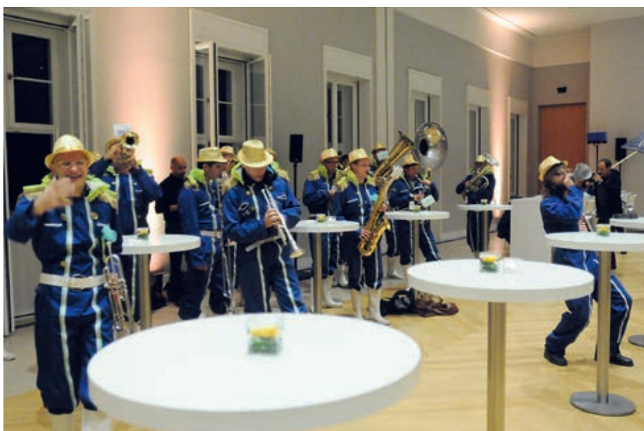
A spontaneous visit from a brass band, which marched from the Non-Conference to the ICCA2015, had participants at the evening reception on their feet and dancing.

It was an honour to be invited to speak at ICCA2015, and I hope that bringing this voice of what people are already doing on the ground, responding to the climate crisis by starting to live in the way we will all need to live and celebrating the benefits of doing so, was useful.