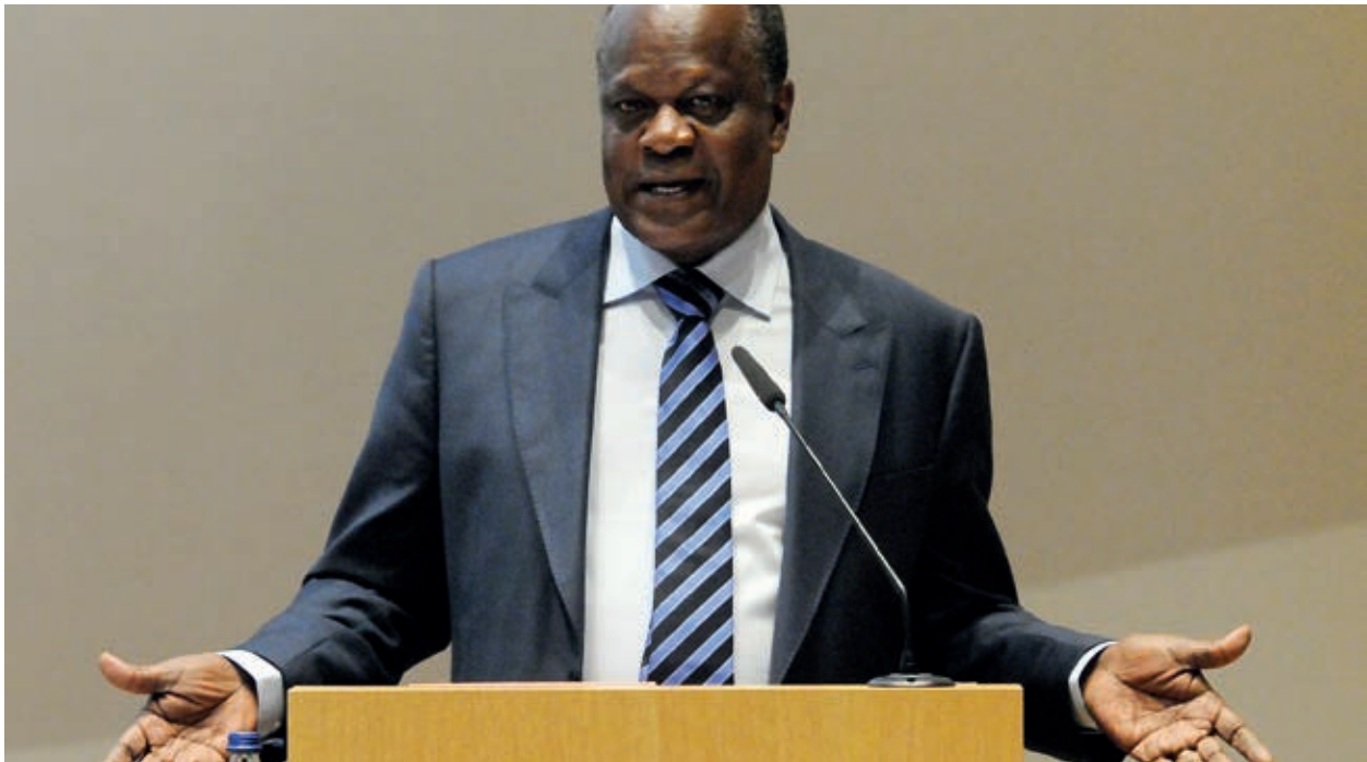
In his speech, Henri Djombo, Minister for Sustainable Development, Forestry Economy and the Environment, Republic of Congo, underlined the importance of international cooperation on climate policy and biosphere reserve conservation.

processing agro-industries and farmers' cooperatives controlling the land.