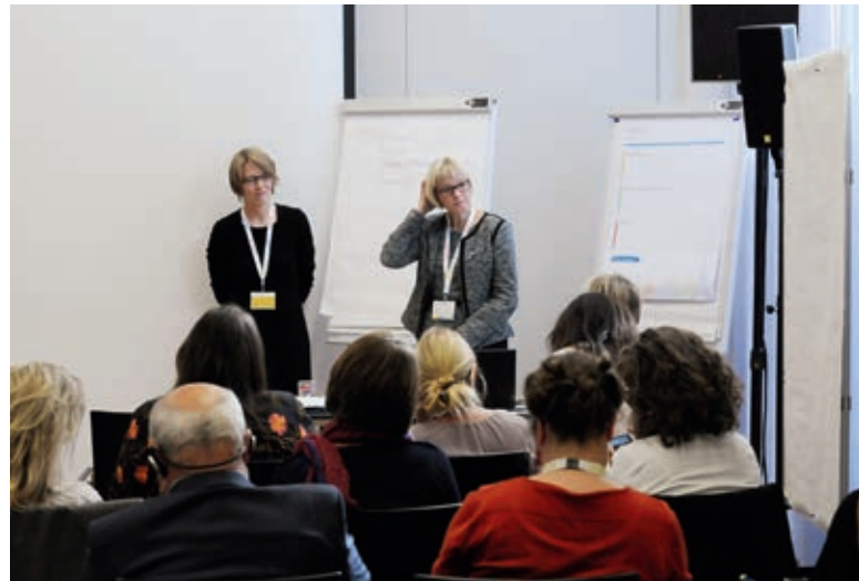
Making climate action socially responsible and inclusive was one topic in the Finance Cluster.