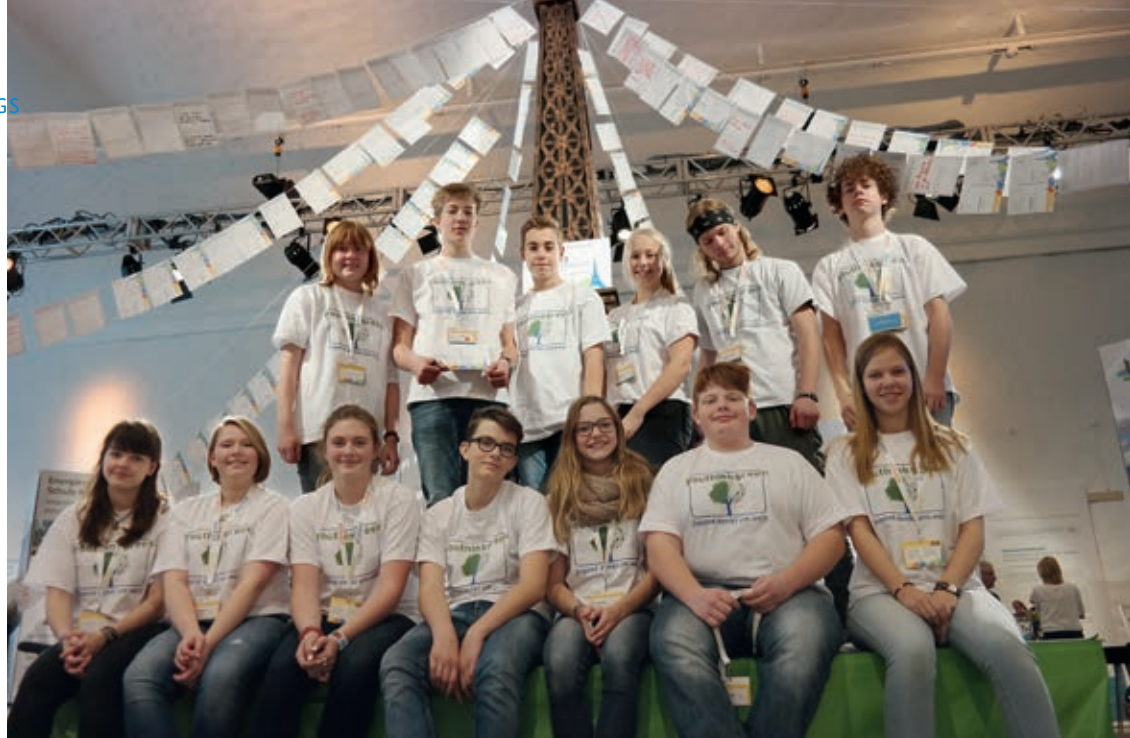
Youthinkgreen Ursulaschule Osnabrück in front of the Eiffel tower model.

The youth organisation from Osnabrück was represented in Hanover by 13 of its members, who were involved in many ways in various parts of the programme: they were part of the editorial team for the Hanover