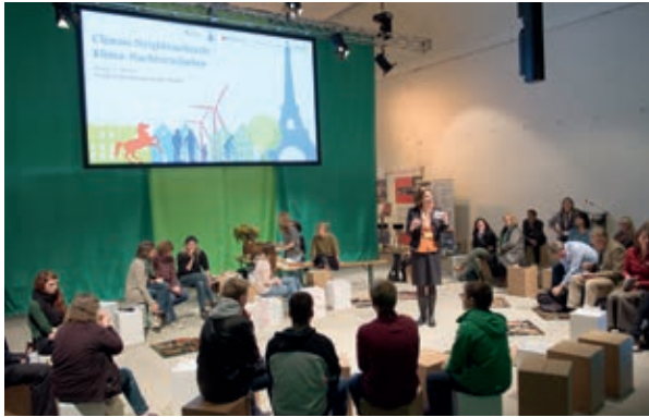
Participants of the forum “On everyone’s lips – the art of climate-friendly nutrition.”