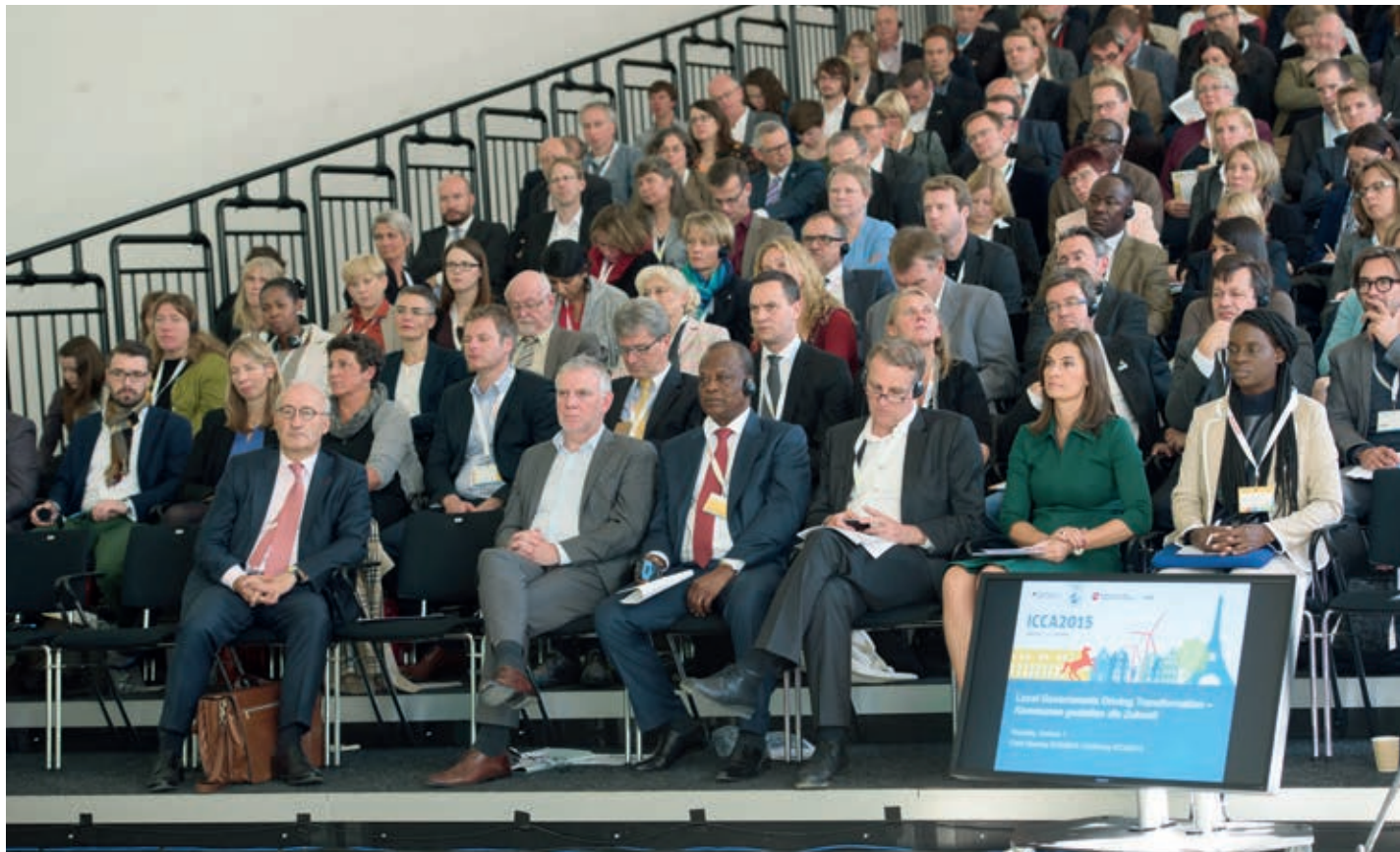
The opening of the ICCA2015 was attended by representatives from the fields of politics, industry and science and was held in the Orangery of Schloss Herrenhausen. Over 400 participants from 27 countries attended the conference.

discussions. Shortly after the UN Sustainable Development Summit in New York, where heads of state and government adopted the Sustainable Development Goals (SDGs), and in the context of conferences such as the European Union Capitals and Large Cities Meeting on Climate in Paris, the ICLEI World Congress in Seoul and the 100 per cent Climate Neutrality Conference in Sønderborg, the ICCA2015 emphasised the importance of sub-national climate action and reinforced the position of municipalities in promoting sustainable development. With a view to the Conference of the Parties (COP21) to the UNFCCC in Paris in December 2015 and the Habitat III Conference in Quito in 2016, the ICCA2015 formulated a strong message to these political forums: Climate action and climate adaptation strategies need to be firmly rooted at local level. Linking up global and local thinking patterns and action is therefore, more than ever, part of the future agenda.