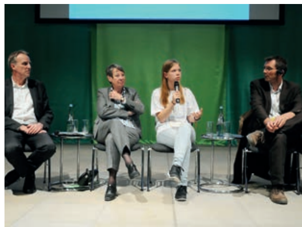
The Fishbowl discussion offered pupils a chance to talk about their concerns.