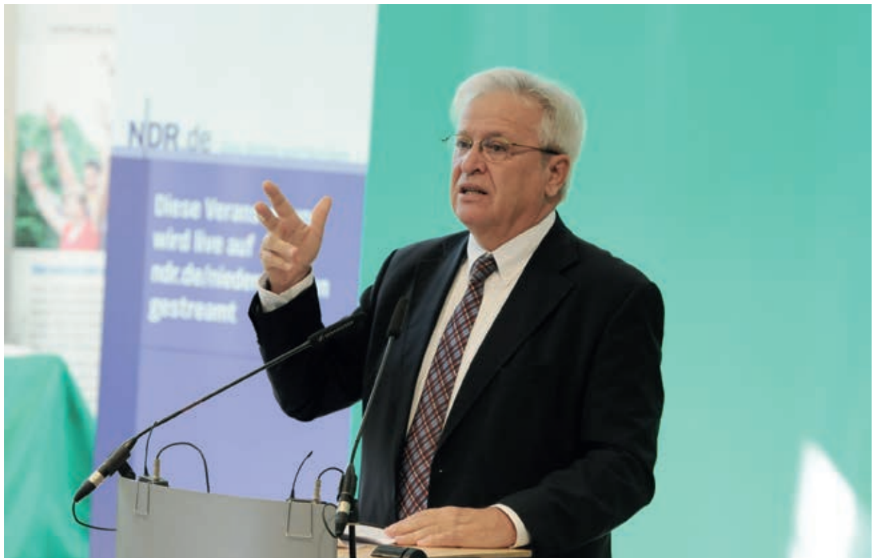
During the opening of the ICCA2015 Dr Joan Clos emphasised the challenges for cities in climate change.

grow by three billion people in the next 30–40 years, the dynamism of cities represents a major sustainable development opportunity.