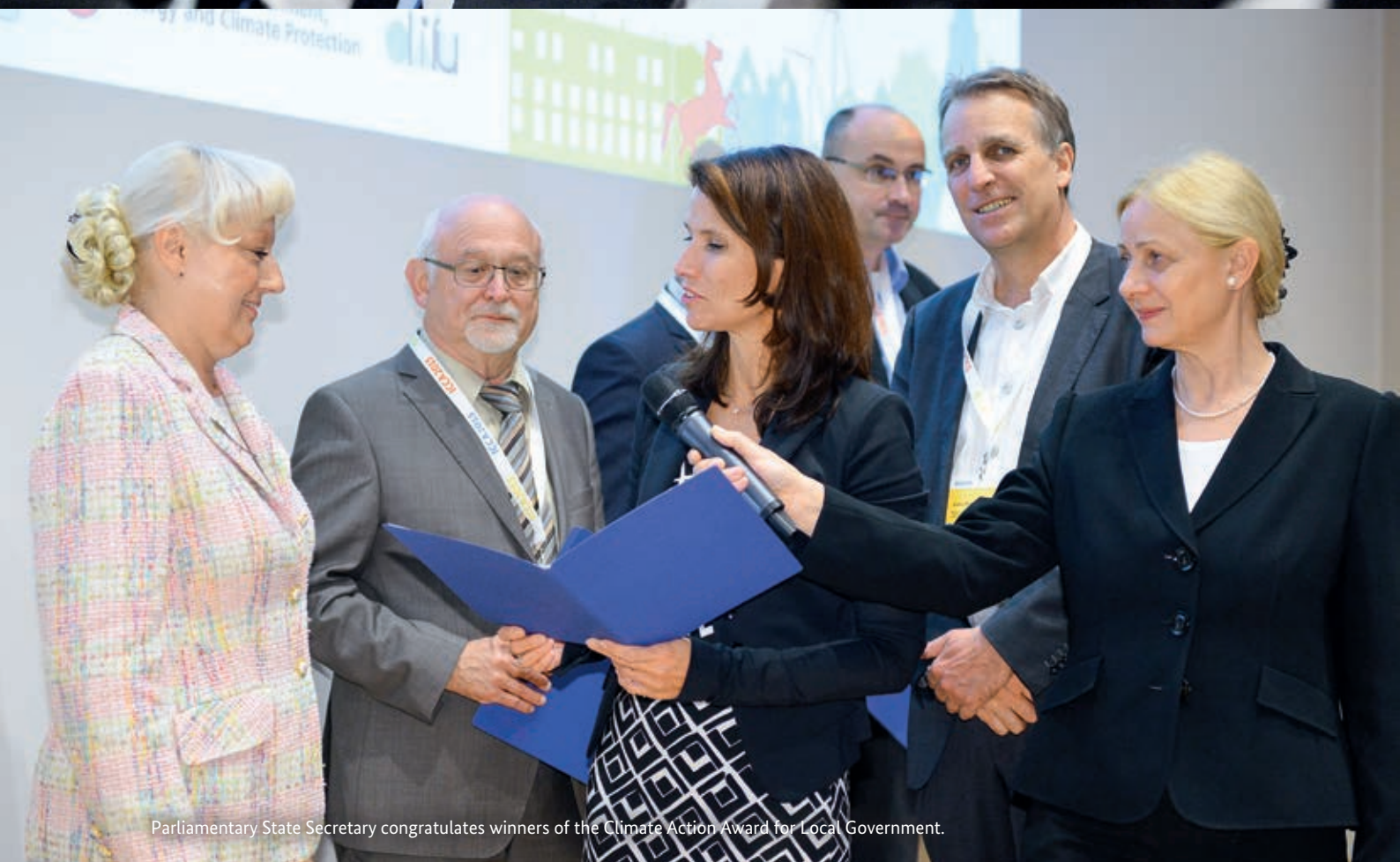
Parliamentary State Secretary congratulates winners of the Climate Action Award for Local Government.