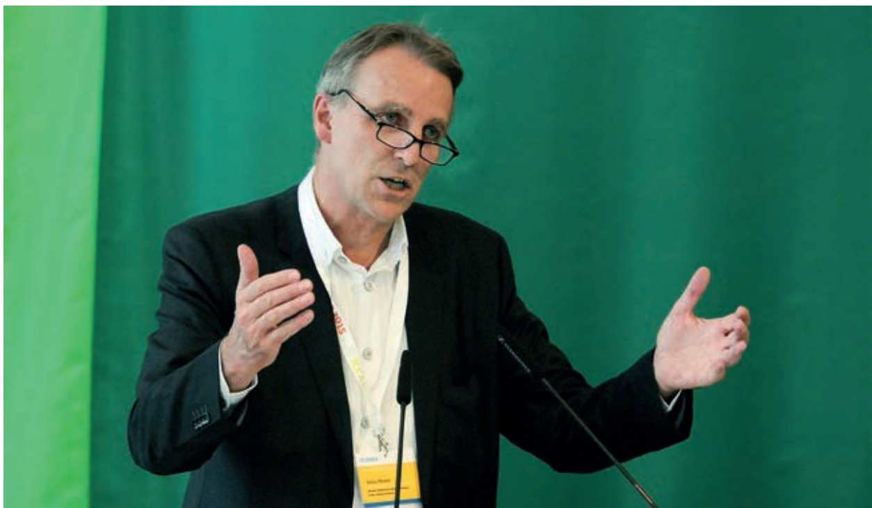
Minister Stefan Wenzel (Ministry for Environment, Energy and Climate Protection of Lower Saxony) welcomed participants to the ICCA2015.

The consequences of climate change can be felt all over the world, even in Lower Saxony.