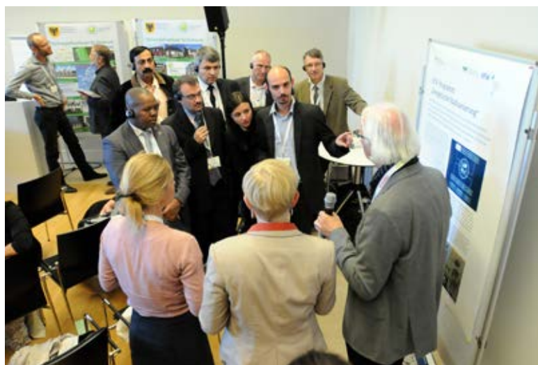
Discussing examples of good practice during a workshop on energy-efficient building and construction.