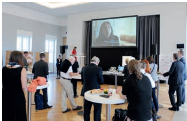
In her video message, Anne Hidalgo (Mayor of Paris) highlighted the major challenges of climate change and the need for an international agreement at COP21.