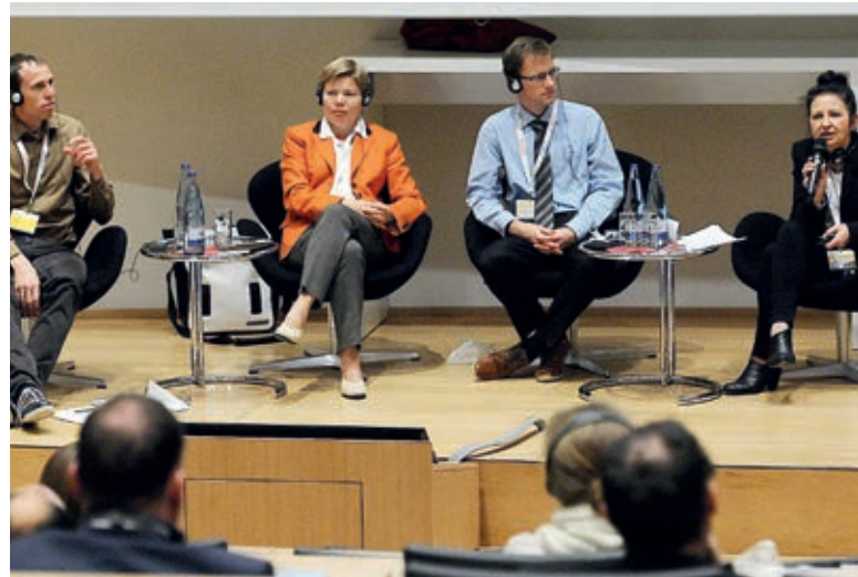
Examples from France, Poland, and Germany illustrated grown structures and partnerships between cities.