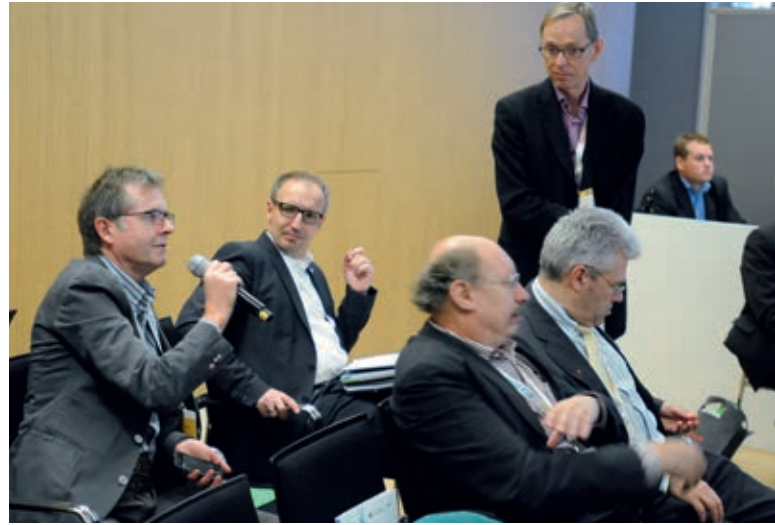
Participants actively contributed their experiences to the workshops.