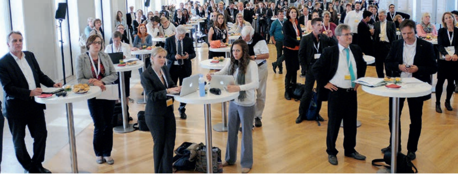
The presentation of conference conclusions brought the participants together again and stressed the special role of local commitment in the field of climate action.