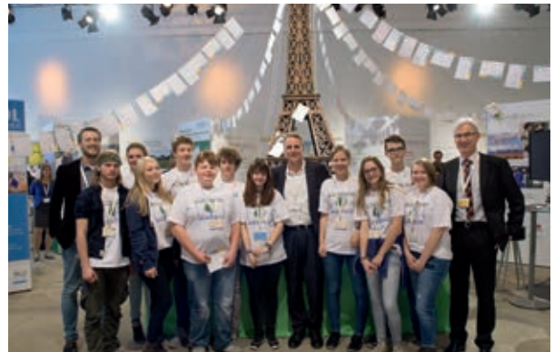
Youthinkgreen – jugend denkt um.welt with Minister Stefan Wenzel (in the middle) and Lothar Nolte (KEAN, right).

changed. There should be more support for activists and project groups at local level to show that they enjoy respect and appreciation. We need more creativity and ideas so as to improve situations. We need more and better bicycle lanes and bus connections in order to make them more attractive and thus achieve reductions in CO 2 emissions.