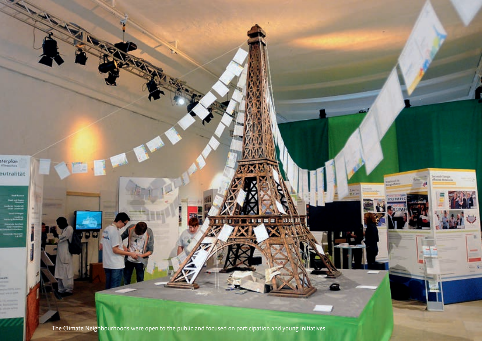
The Climate Neighbourhoods were open to the public and focused on participation and young initiatives.

The Federal Ministry for the Environment, Nature Conservation, Building and Nuclear Safety (BMUB), the Ministry for Environment, Energy and Climate Protection of Lower Saxony and the German Institute of Urban Affairs (Difu) welcomed participants to Schloss Herrenhausen . The Climate Protection and Energy Agency of Lower Saxony (KEAN) organised further activities open to the public. The so-called Climate Neighbourhoods hosted an exhibition and several interactive events.