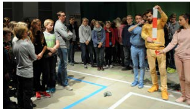
Participants of “The Climate Conference.”

„Youthinkgreen – jugend denkt um.welt“ is a non-profit organisation that aims to promote education on the