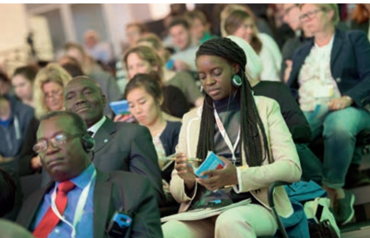
Participants of the Climate Diplomacy Panel with voting cards for the play.